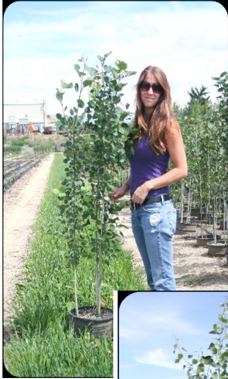
#5 Mult 5'