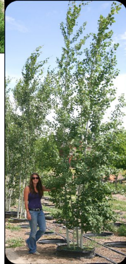
#45 Mult 20'