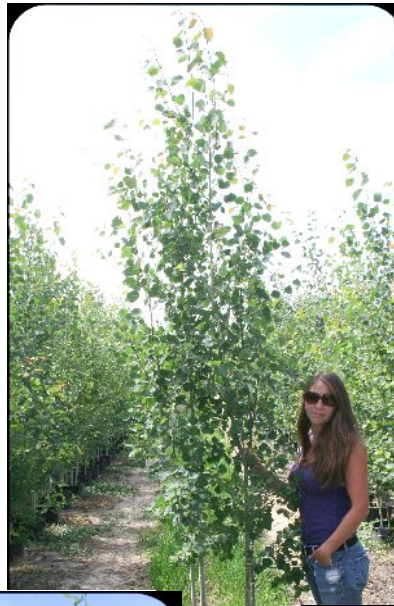
#10 Mult 8-9'