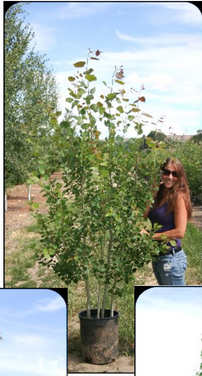
#7 Mult 6-7'