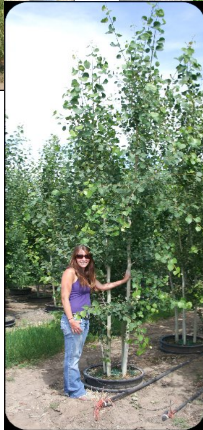
#25 Mult 14-16'